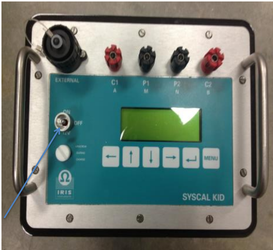
Figure 5 Here is the on switch for the Syscal KID unit. It is a toggle switch, and not a rotational switch, despite the knurled knob.